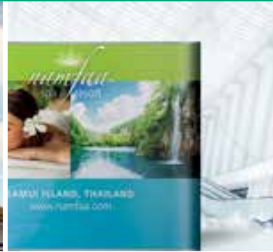
pop-up and roll-up displays