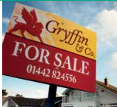
short-term outdoor signage