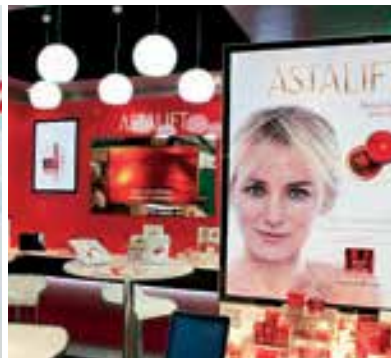
day/night backlit displays