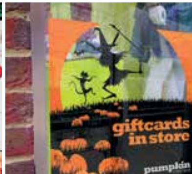
clear film window graphics