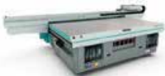
Standard bed 1.25 x 2.5m