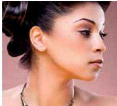
cosmetics retail graphics