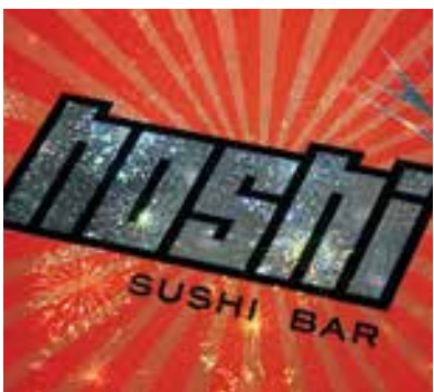
special effect materials