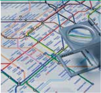
close view signage