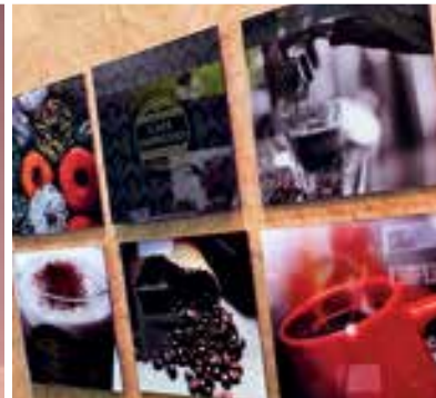
transparent reverse prints