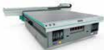
X2 bed 2.5 x 3.05m