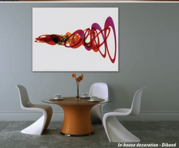
In-house decoration - Dibond