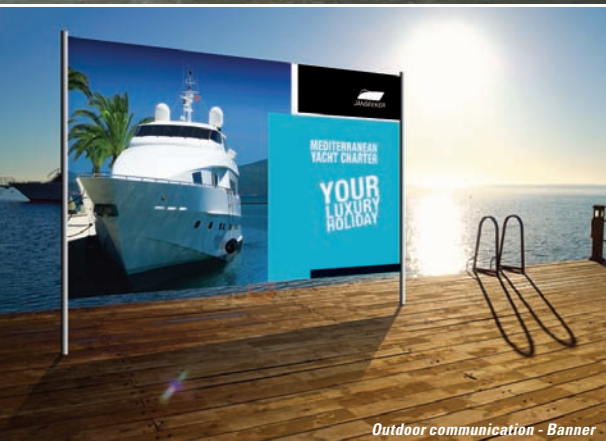
Outdoor communication - Banner