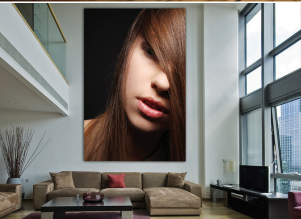
In-house decoration - Essense paper